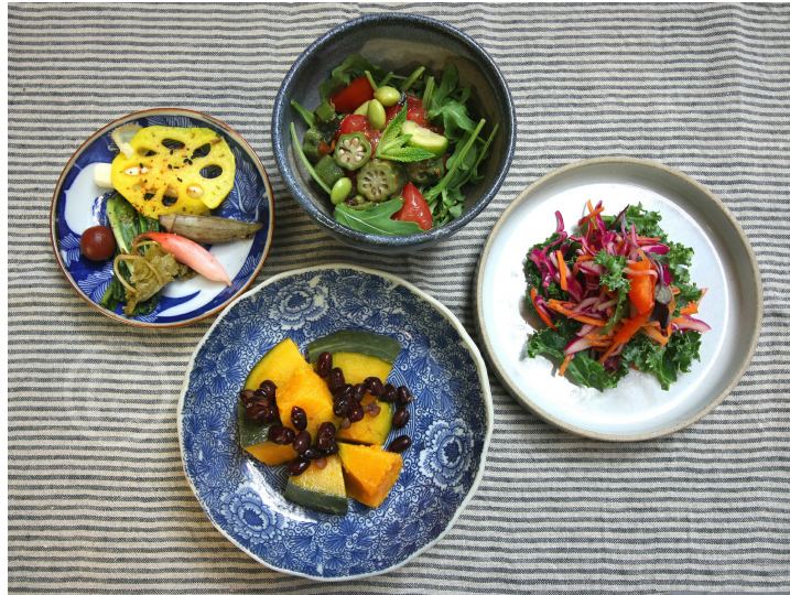
Ni Japanese Deli, Assorted sides

What was one difference in working in a big kitchen versus running your own space? You have a very modest-sized kitchen.